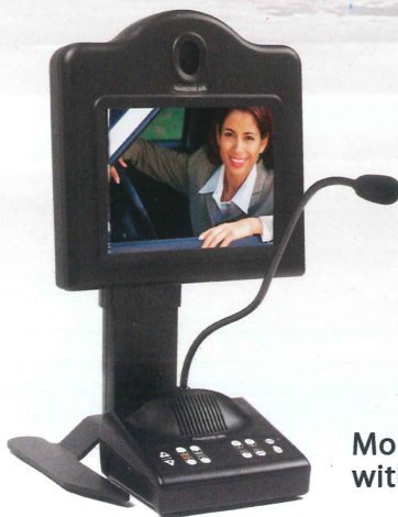
Model 5550 Teller Video with 5501 Series Audio Console