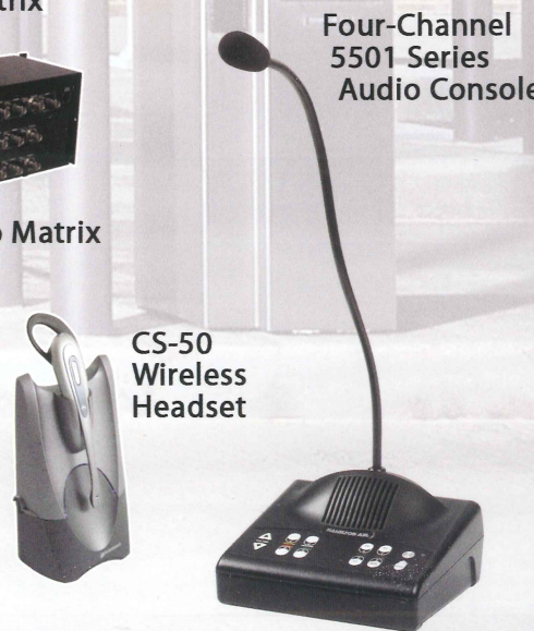
Four-Channel 5501 Series Audio Console