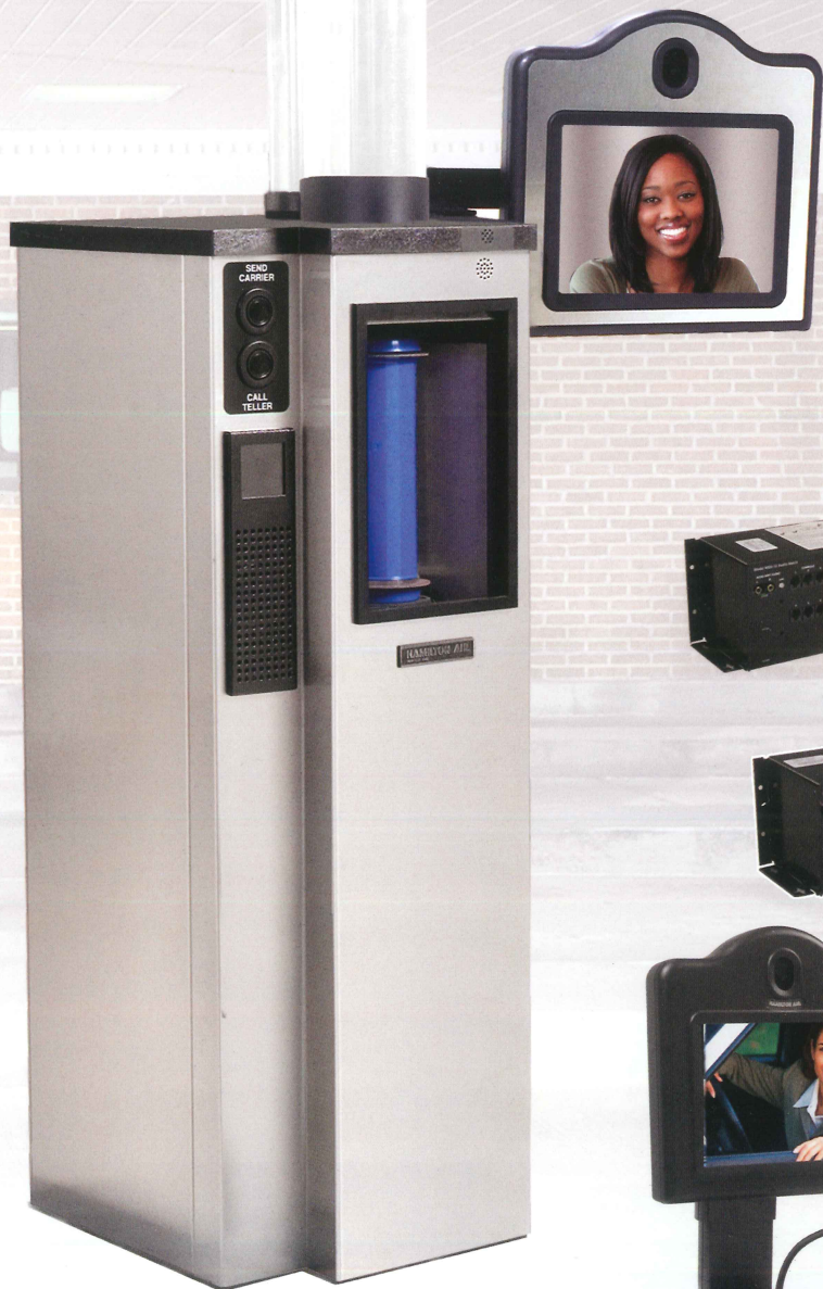
HA-1000 Upsend with Model 5517 Customer Video