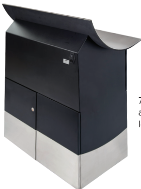
700 Series rear access offers lobby integration