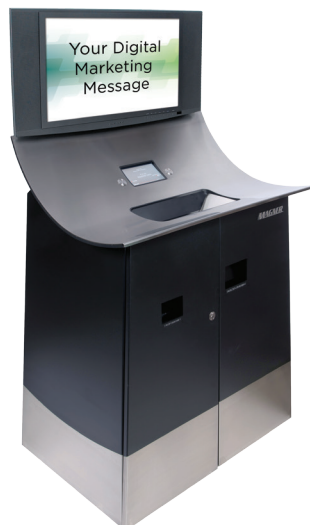
700 Series illustrated with optional (or your) Digital Marketing screen